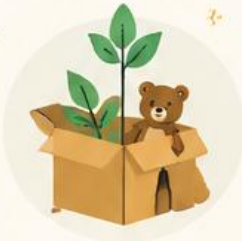
Changes at home

Tell us early and we will work with you.